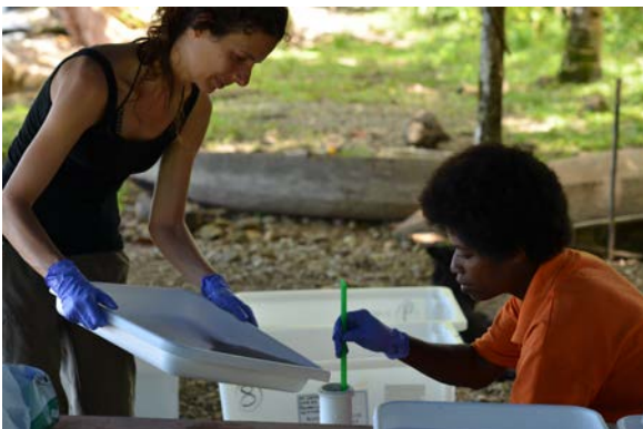
The 500- \mu m and 106- \mu m are concentrated on a 40- \mu m nytex mesh