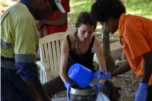
Sieving the water content of the ARMS retrieval tub into a new clean tub

The three fractions collected with the 2-mm Sieve (left) 500- \mu m sieve (middle) and the 106- \mu m sieve (right)