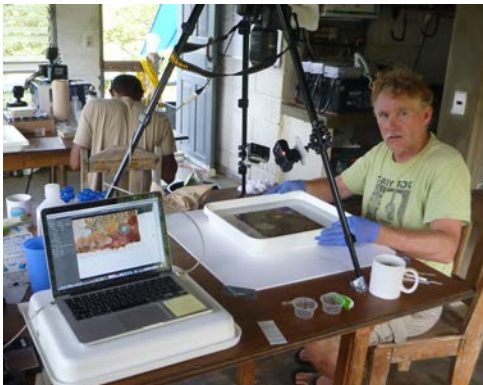
Camera connected to the computer