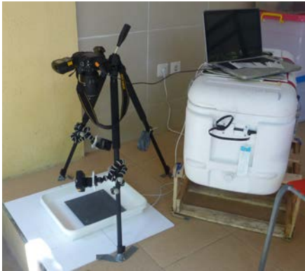
Plate photo set-up

Schematic of the grid used to standardize the photos. The photos can also be taken without this system but make sure they overlap and are taken on the same plane