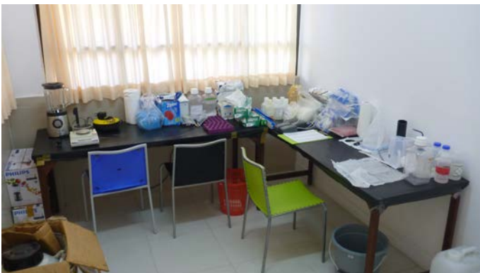
Example of lab set-up